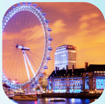
Coca-Cola London Eye