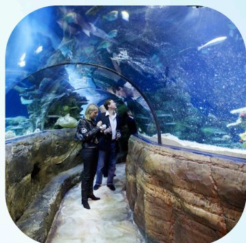
SEA LIFE London