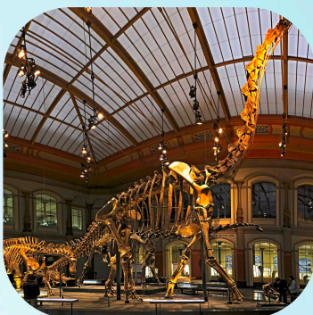
Natural History Museum