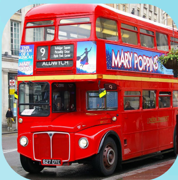
Hop on hop off bus tour