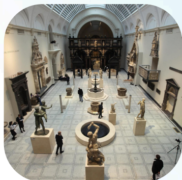
Victoria and Albert Museum